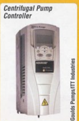
Centrifugal Pump Controller