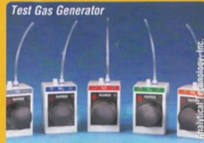
Test Gas Generator