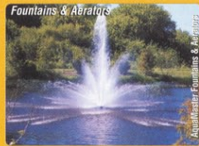
Fountains & Aerator

Underground Storm Water Detention System Proves Effective in Grand Rapids, Mich. See page 10