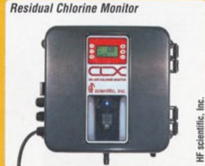
Residual Chlorine Monitor