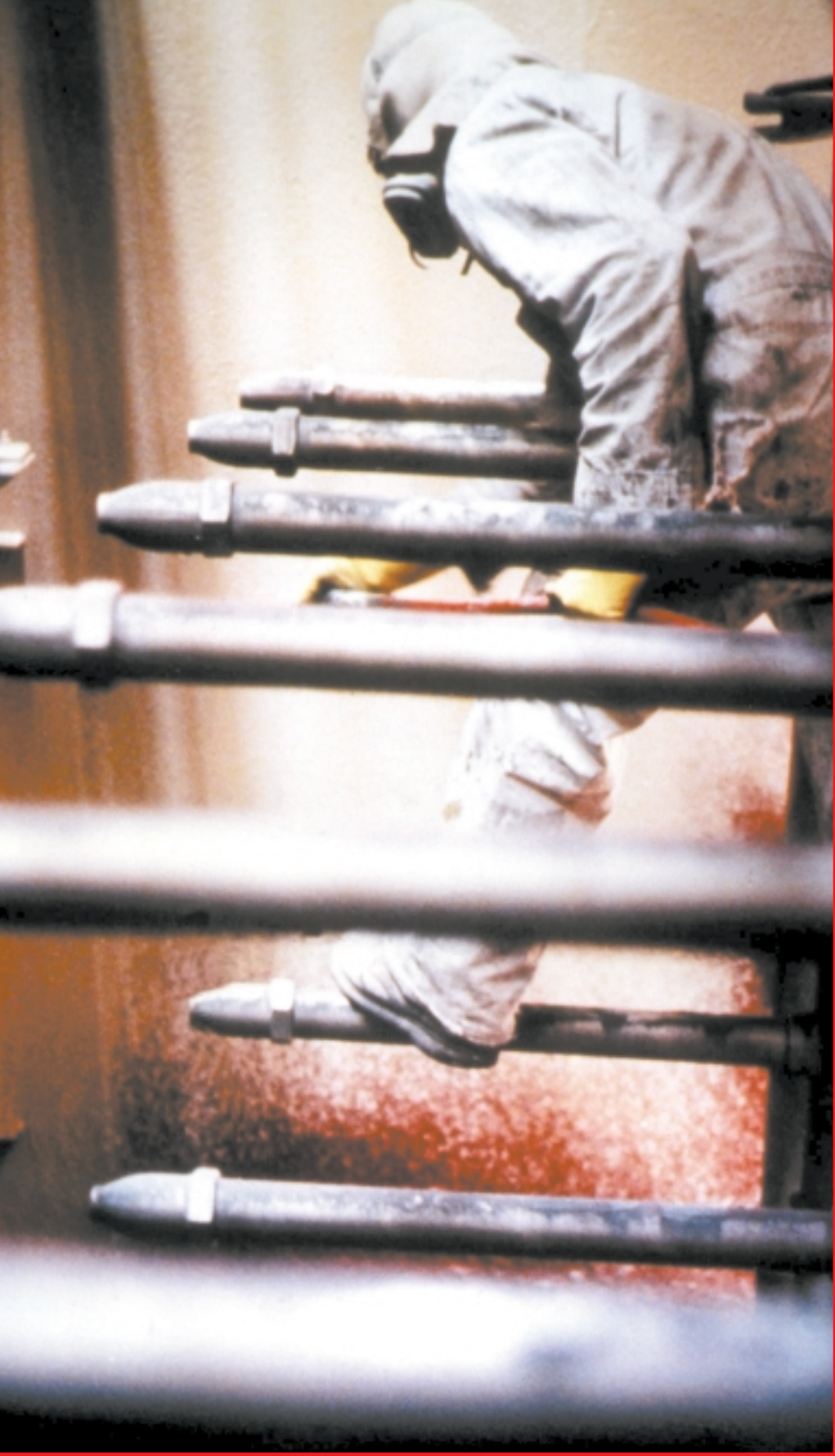
FiberCrete spray application inside a scrubber module.