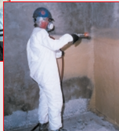
Spray applied SewerGard Lining