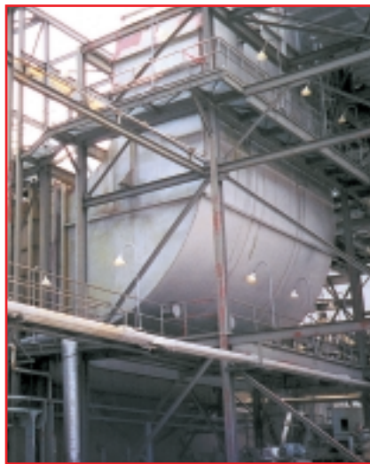
Scrubber modules are ideal structures for fiber-reinforced linings.

Primary and secondary containment also benefit from low-perm, fiber-reinforced linings. Whether conditions involve immersion or simply incidental spills, the ramifications of failure dictate selection of only the highest quality materials.