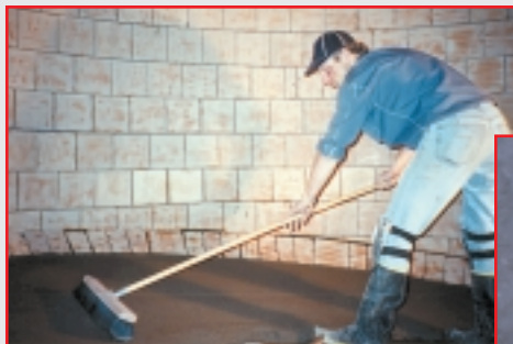
Tile chest awaiting Fast-Trak application.