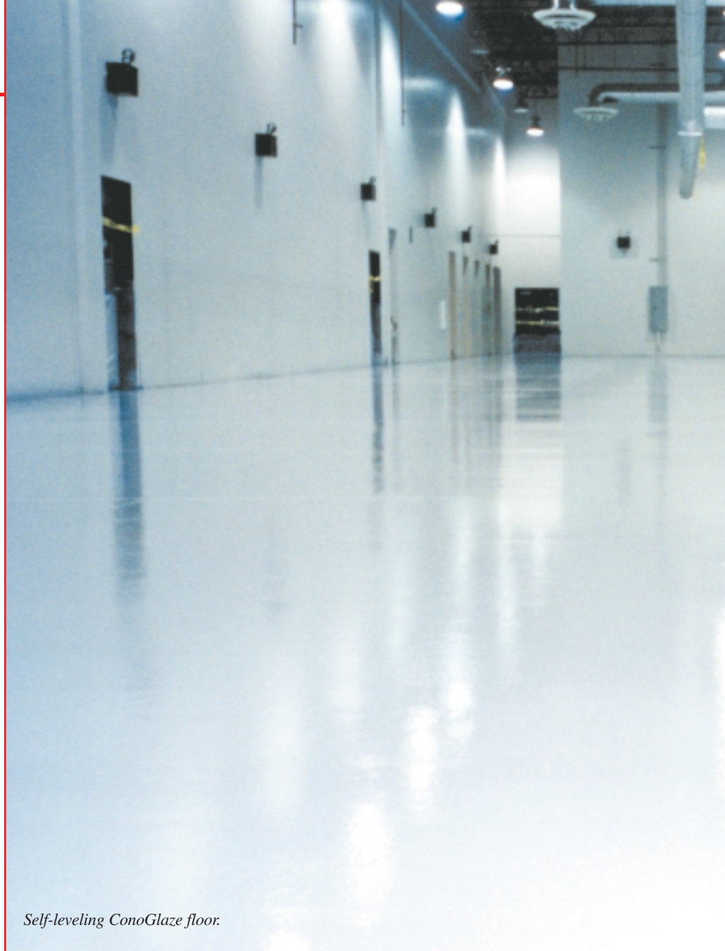
Self-leveling ConoGlaze floor.

A better choice in physical durability is ConoSpread . The major difference is that ConoSpread is a heavier slurry distributed using a screed rake. The viscosity and thickness of ConoSpread is customized by project allowing for the convenience of bulk packaging. This also minimizes cost for large areas.