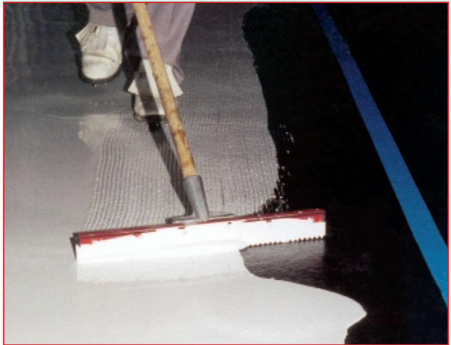
Pour and Spread