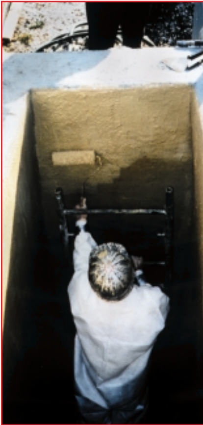
Trowel and backroll

Sauereisen also recognizes that there is no single "best" way to install coatings and linings. Selection of application method is contingent upon many considerations. Our products are tailored to be compatible with a variety of application methods including airless spray, spincast, trowel, roller and pour-and-spread.