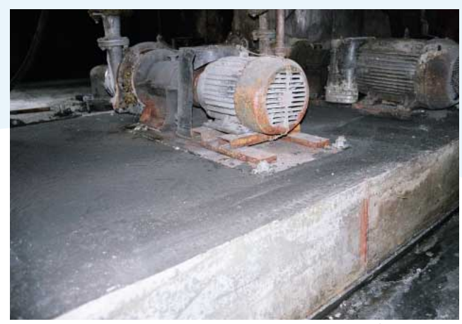
Pump pads exposed to acidic conditions are ideal for polymer concrete.

• Acidproof Concrete – Structural Grade No. 54SG – Like its gunite-applied predecessor, this modified castable material withstands the highest temperature ranges and acid concentrations.