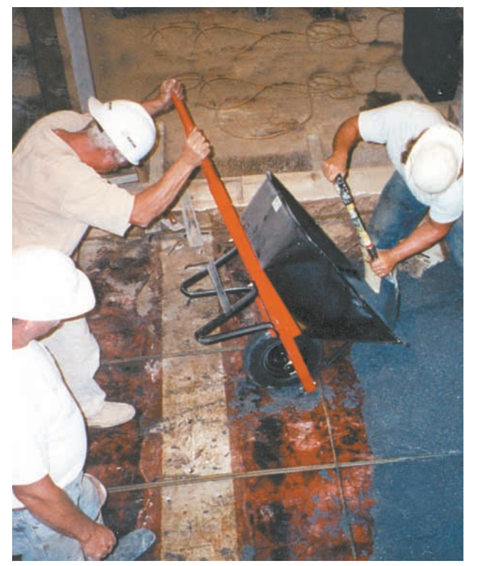
Polymer concretes exhibit working properties and application methods similar to standard Portland-based materials.

Our heavy-duty castable materials combine the working properties of concrete with the durability of chemicalresistant polymers. The end product is a monolithic providing effective corrosion protection without being vulnerable to physical abuse. Perhaps the greatest benefit of polymer concrete is long-term performance comparable to that of a brick lining.