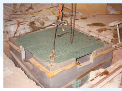
Tanks and trench sections can be pre-casted with polymer concrete.

Sauereisen Polymer Concrete sets by a catalyzed reaction. The brief cure time allows for industrial infrastructure to be serviceable much sooner than the case where new concrete