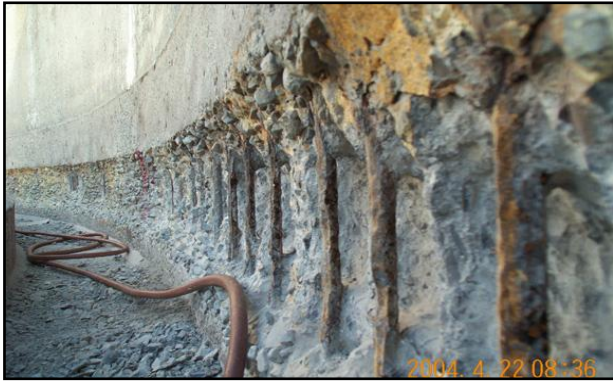
Eroded and corroded trough wall following hydro-blast prior to rehabilitation.