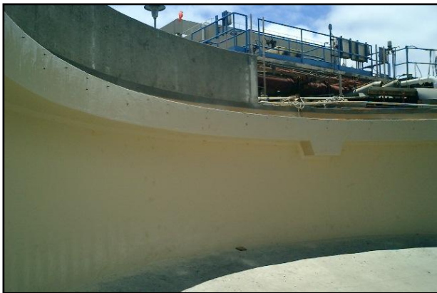
View of completed walls protected with SewerGard 210G